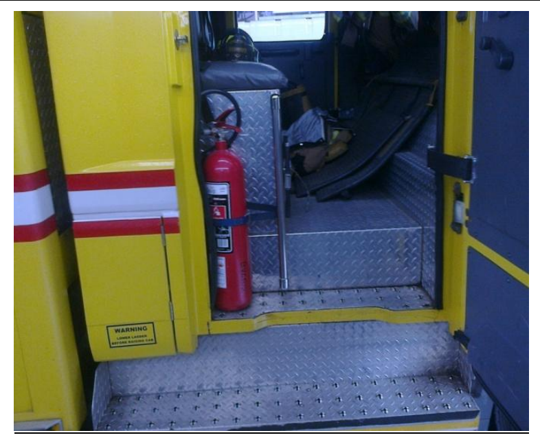
CREW CAB (Par 1.12)