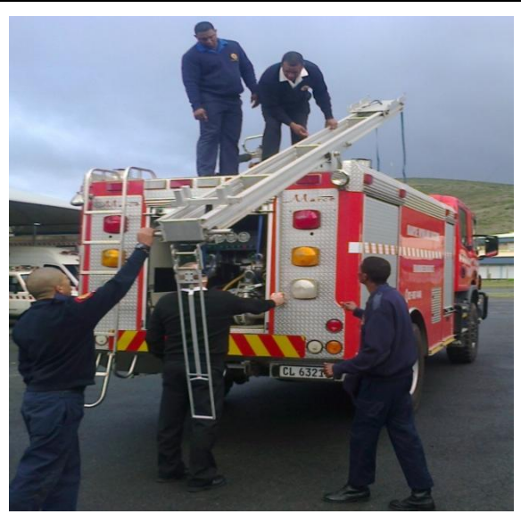
LADDER GANTRY TO REMOVE THE LADDER FROM THE ROOF OF APPLIANCES TO THE GROUND. (Par 2.17)