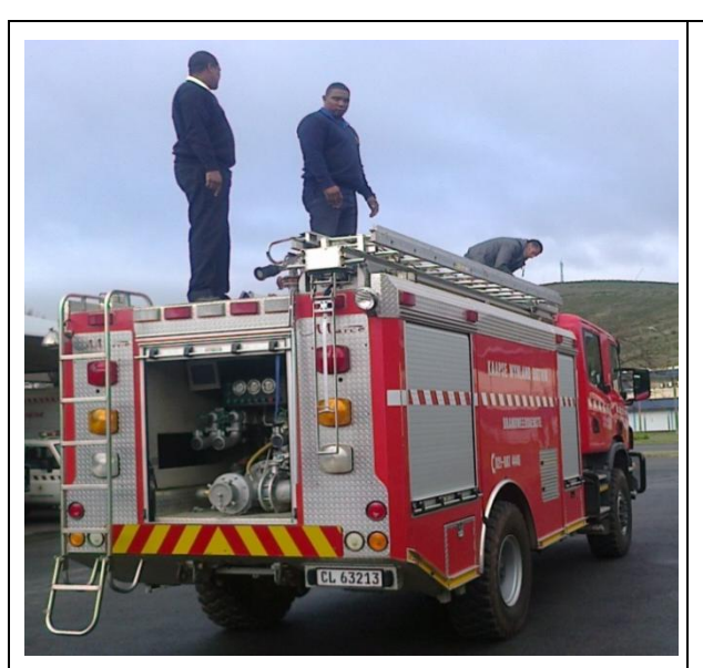
REAR ACCESS LADDER & GRAB HANDLES (Par 2.16)