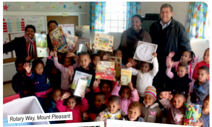
Rotary Way, Mount Pleasant