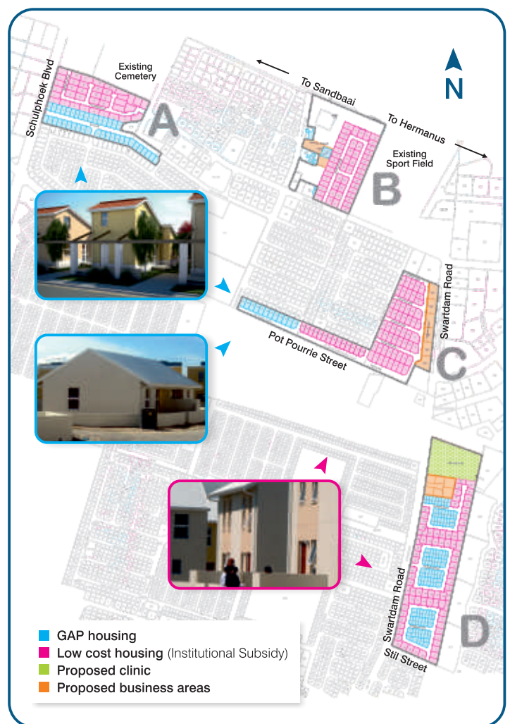
PROPOSED HOUSING PROJECT IN ZWELIHLE

Although the upgrading of informal settlements enjoys the highest priority since it offers a high return in terms of improved living conditions and secured tenure and basic services, sites must be fully serviced before finance can be obtained from government.