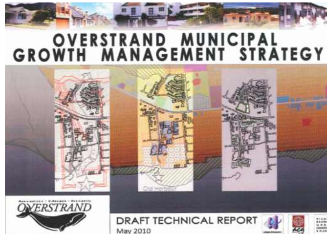
The cover of the draft strategy document.

The draft strategy document was available in the Gansbaai, Stanford, Hermanus, Hawston, Kleinmond and Betty's Bay municipal libraries and public open sessions were held in Hermanus, Gansbaai and Kleinmond.