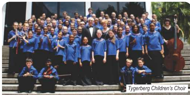
Tygerberg Children's Choir