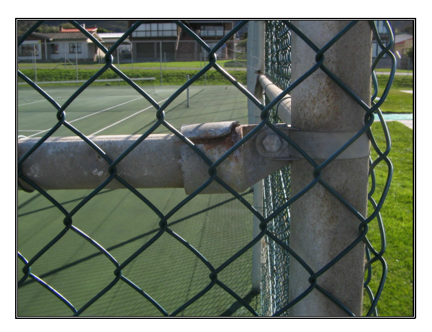
Rail corner connector that needs replacement