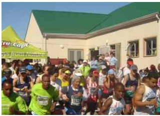
I-Tru-Cape Kogelberg Mountain Challenge ngumcimbi wokuqala owathi waqhutylwa kweli holo litsha loluntu.

I-Overstrand inqwenela ukuba uluntu luqhubele phambili ngokuphila ubomi obuphucukileyo, ngenxa yesi sizathu, azikho ngaphantsi kweshumi elinesithandathu iholo zoluntu eziye zalungiswa zasemgangathweni okanye zakhiwa kule minyaka mithathu igqithileyo.