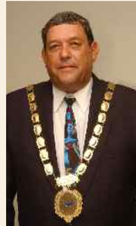
Executive Mayor Cllr Theo Beyleveldt

The Executive Mayor, members of the Mayoral Committee and the Speaker are full-time councillors.