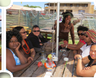
Human Resources Department