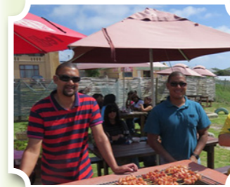
Human Resources Department

Most of the department really enjoyed themselves in different ways of ending off the year; below are some of the highlights of what was going on while people were enjoying themselves: