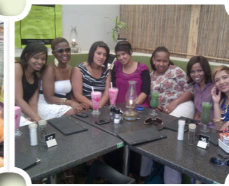
Local Economic Department