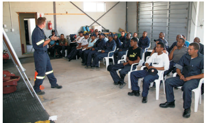
Reservist recruits of Overstrand's Protection Services underwent thorough training in November and were ready to render assistance with the 48 brushfires, four formal house fires, 16 informal house fires and four rescue operations during the holiday season.

Heavy traffic was experienced on Overstrand roads. According to many observers, more people visited the area this year, but they stayed for shorter periods. Speed checks were conducted on a regular basis and there were many parking transgressions. Several motor