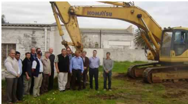
Ooceba, amagosa neenkokheli kwezoshishino zazikhangele ngomdla umatshini omkhulu wokwenza indlela oza kusetyenziswa ukuwakha indlela eza kuphungula ukuxinana kweenqwelomafutha kwiCBD.

ngesRoyal Street iza kuyeka ukuba yi-Unit