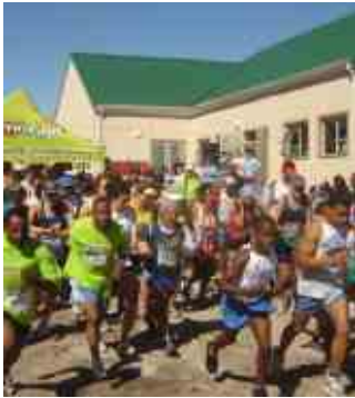
The Tru-Cape Kogelberg Mountain Challenge was one of the first events to be hosted at the new community hall.

Overstrand would like a healthy community life to flourish, and for this reason, no fewer than sixteen community halls have been upgraded or built from scratch over the past three years.